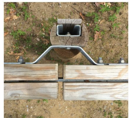
NatureRail® Top View