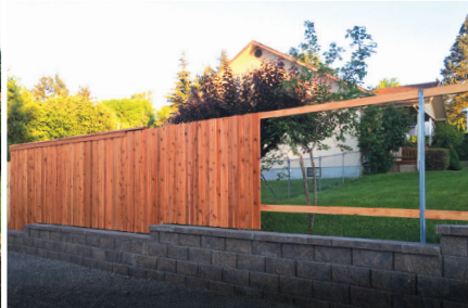
Step 1> SET POST AND SLIDE ON BRACKET